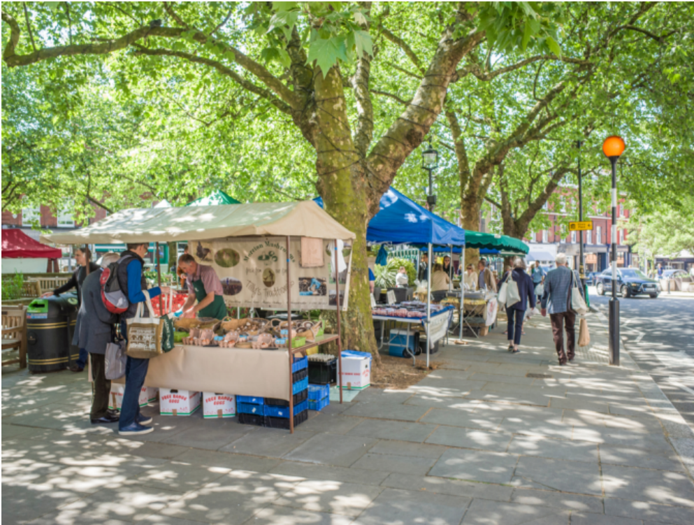
Pimlico Farmers' Market