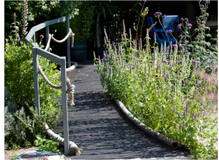
St Mary's Secret Garden, Hoxton