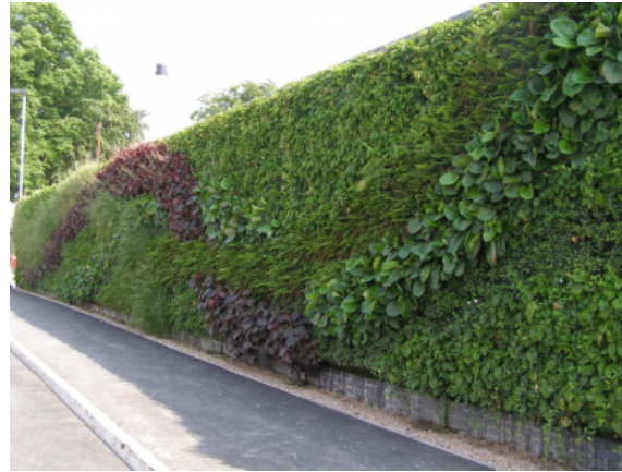
Making Lewes Green Wall