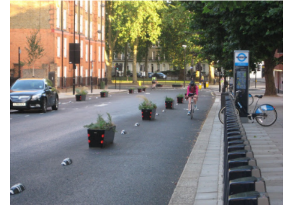
TfL London cycling Design Standards