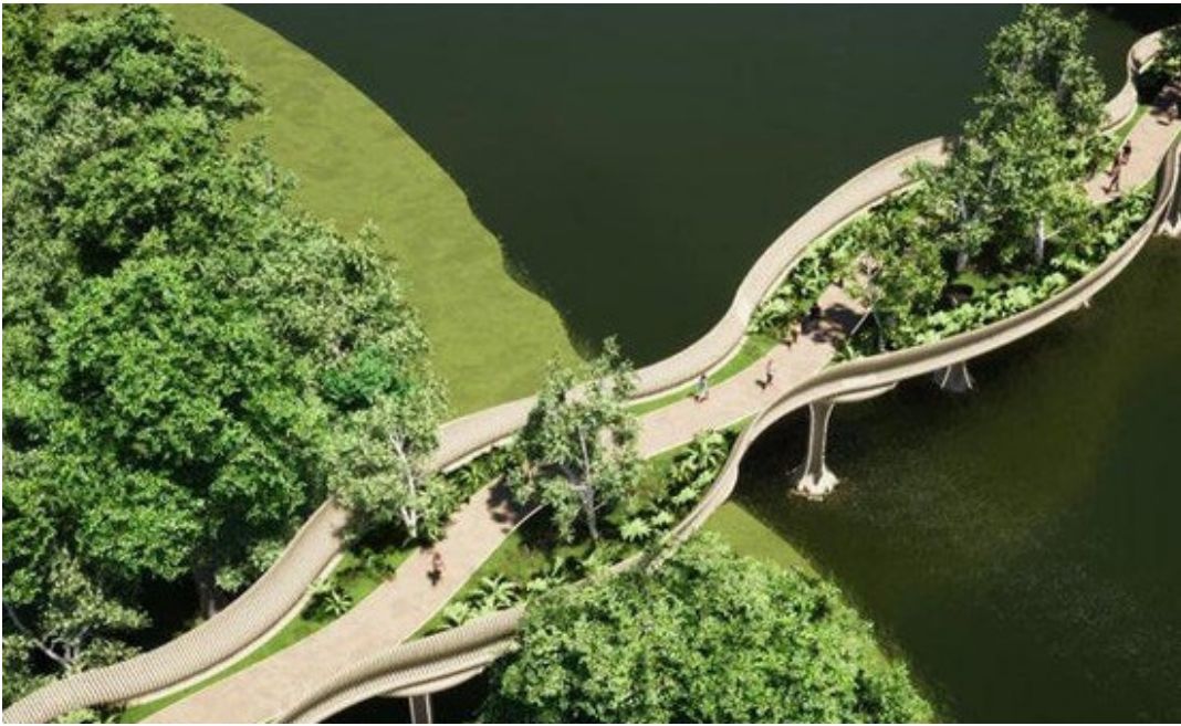
Proposed Garden Bridge, River Ribble