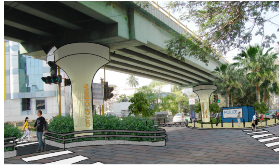
Flyover – KSM Architecture