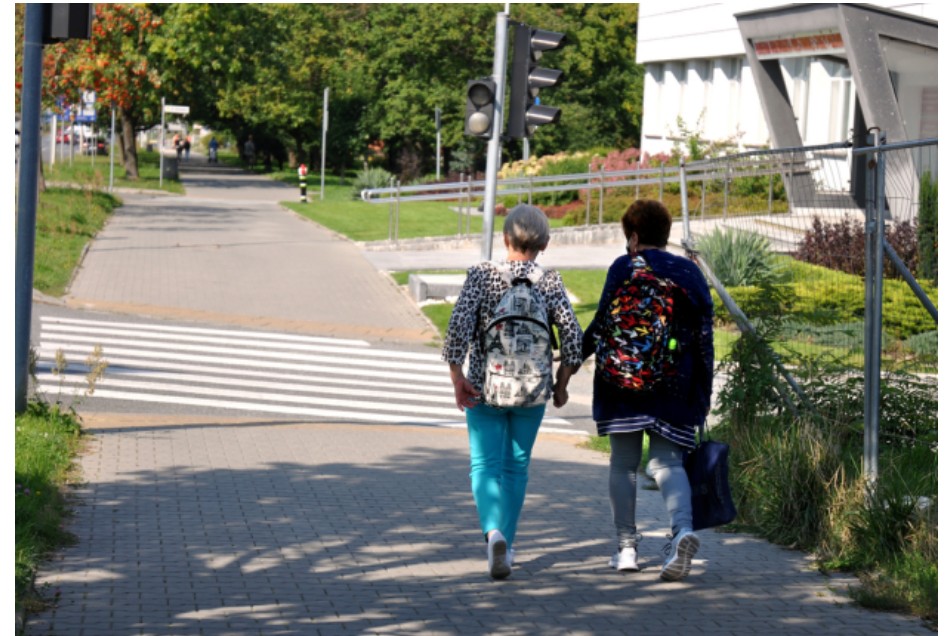
Kielce, Świętokrzyskie, Poland