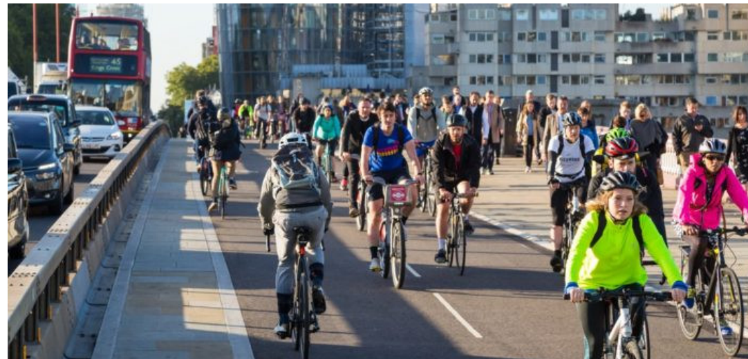
Blackfriars Bridge.