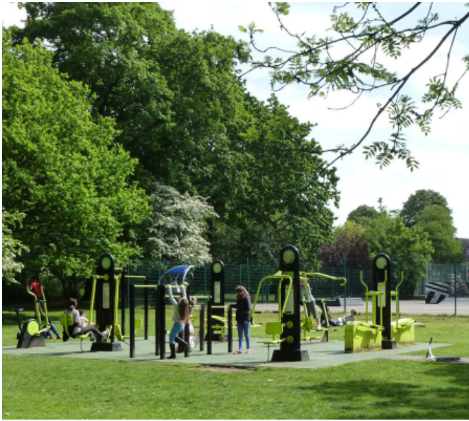
Peckham Rye outdoor gym