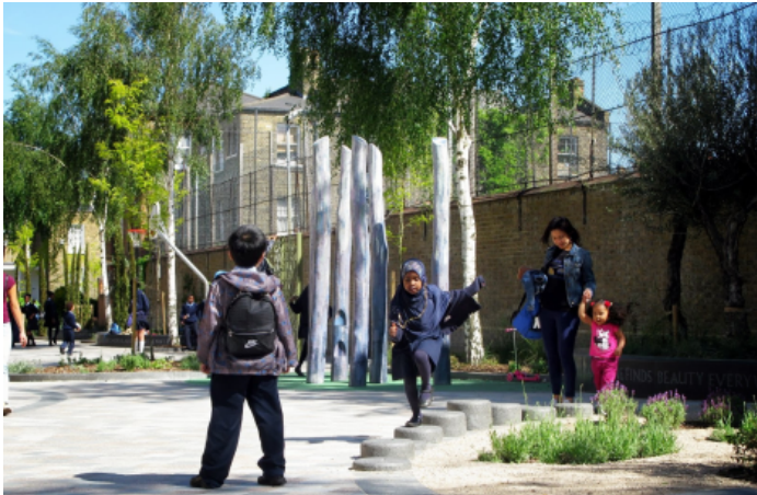
Van Gogh Walk, Lambeth