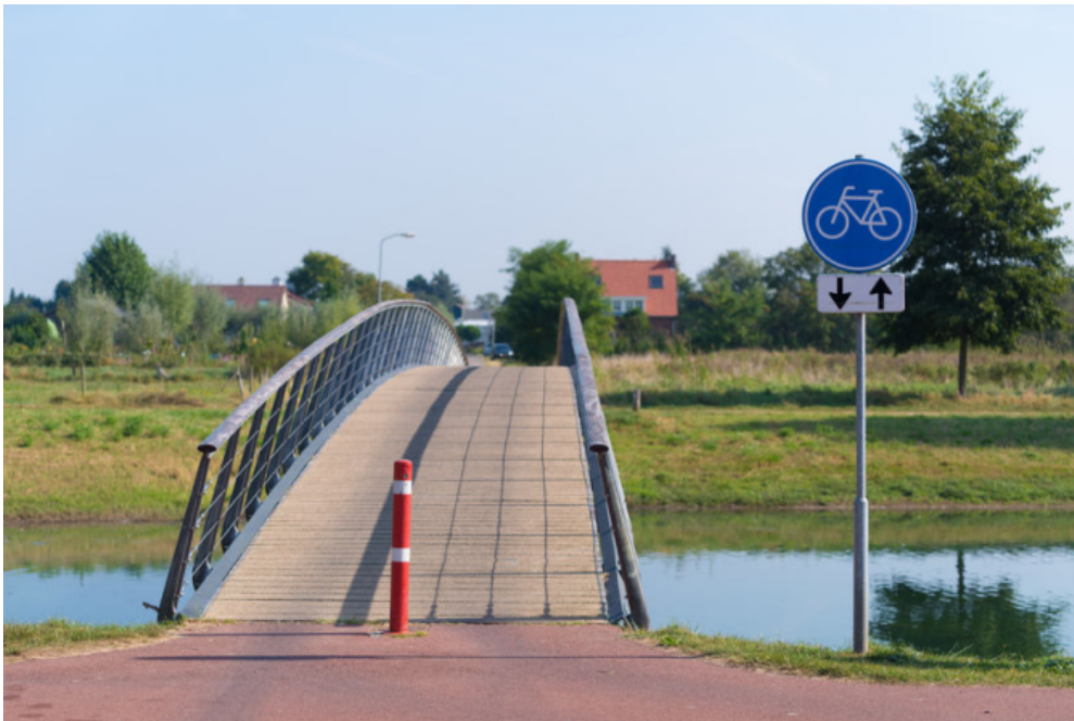
Canal bridge, Holland