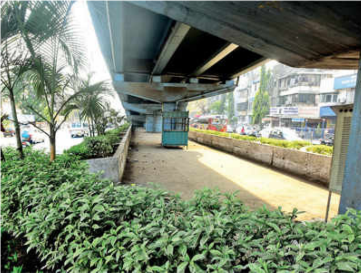
Matunga under-flyover garden