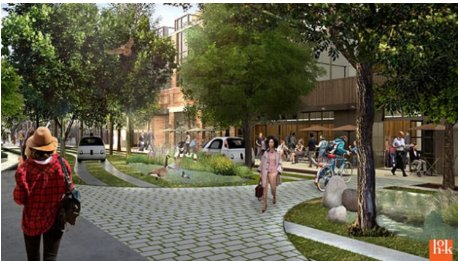
Urban Land institute