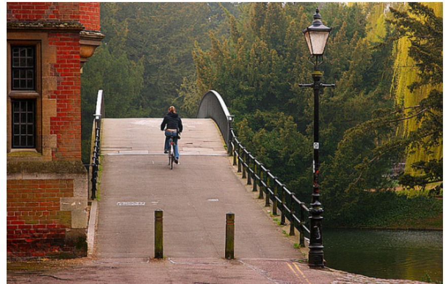
Garret Hostel Bridge, Cambridge